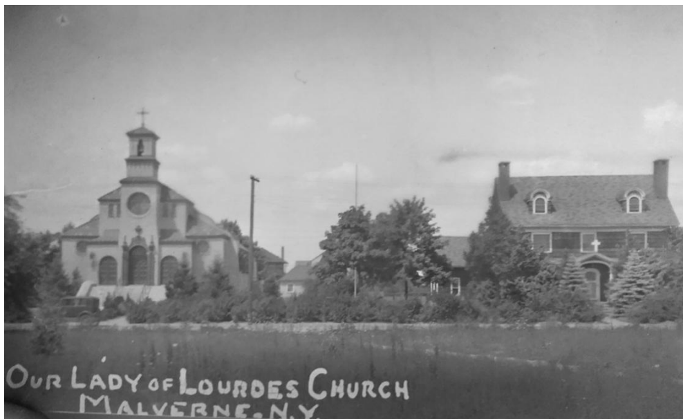
Our Lady of Lourdes Church and Rectory, circa 1932.

This year marks the 95 th Anniversary of the founding of Our Lady of Lourdes Parish. In the next several weeks and months, we will share the remarkable history of this Parish. .